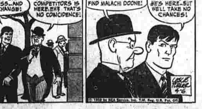
BY PETE HOPFMAN