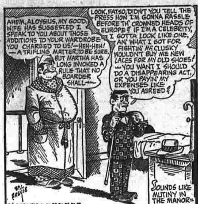
CARNIVAL BY DICK TURNER